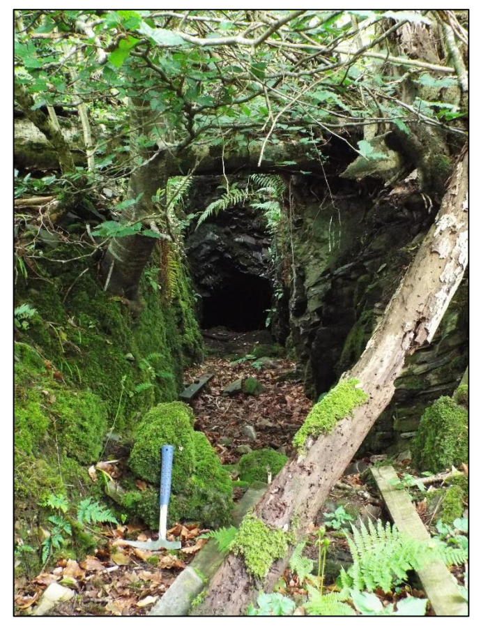
Figure 2: Mining remnants from the Blackcraig mine within the licence area.

Important stakeholder engagement through the Scotland-based social and community risk specialist consultancy is ongoing with all parties regularly being updated on the Company's activities, progress and plans within the area and any comments and suggestions well received and incorporated into these plans.