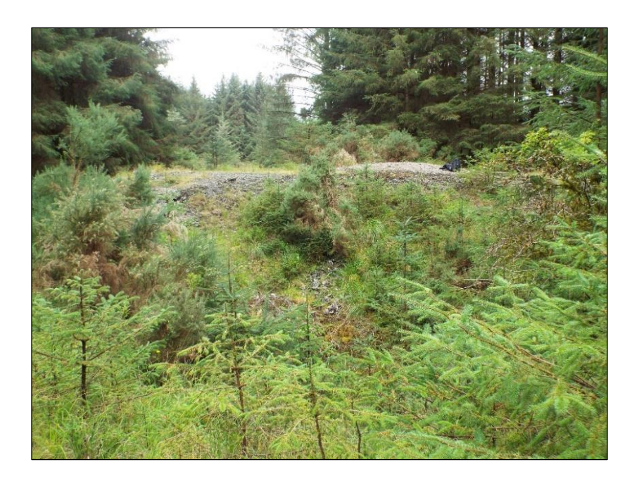
Figure 1: Historical spoil heaps of the Silver Rig mine within the licence area.

Covid-19 restrictions have somewhat delayed the permitting applications for the planned low-cost tenement scale airborne-drone geophysical program as previously reported, with final approvals expected to be granted within the fourth quarter. This will now proceed upon election once approvals are received.