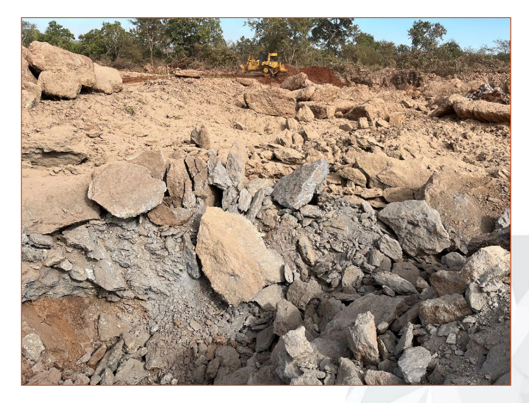
Figure 3: A visually distinct high-grade graphitic ore zone (dark grey) within the starter pit area. The grade of the exposed graphite ore is estimated to be between 30% - 40% TGC.