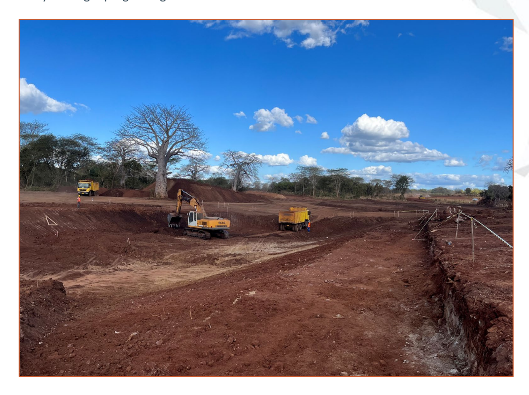
Figure 4: Excavation and shaping of the return water sump at the distal end of the TSF.

Stormwater drainage around the entire TSF area, trenching for the installation of the drainage piping, access roads and clearing for the security fencing is progressing to schedule.