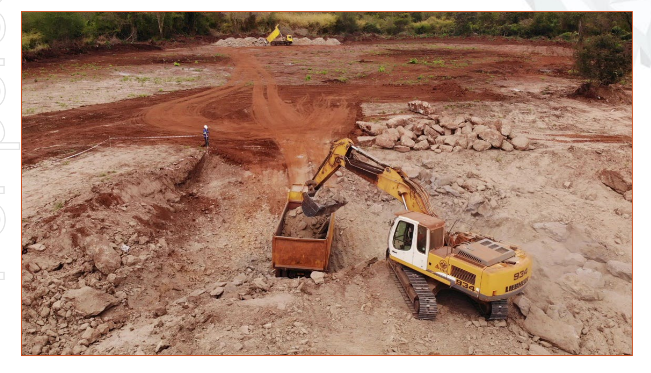
Figure 2: The box-cut being opened with the loading and hauling of the fragmented blasted material. The temporary high-grade stockpile is in the background.

This high-grade material is visually very distinct from the waste and/or lower grade graphitic units and is being stockpiled for use during the commissioning of the processing plant (refer Figure 2). Ore zones are demarcated, and a "spotter" is used to direct the separation of ore from waste.