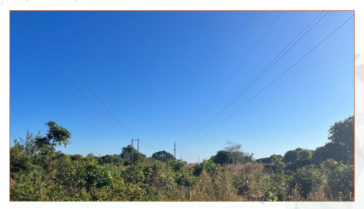
Figure 7: 33kV powerline (right) and the 4.5MW powerline (left) running alongside and to the west of the Lindi Jumbo mining license.

Installation of the 4.5MW powerline is progressing well and has reached the village of Matambarale, approximately 3km to the west of the mining licence. On completion, this line will supply continuous power for the entire operation once commissioning starts (refer Figure 7).