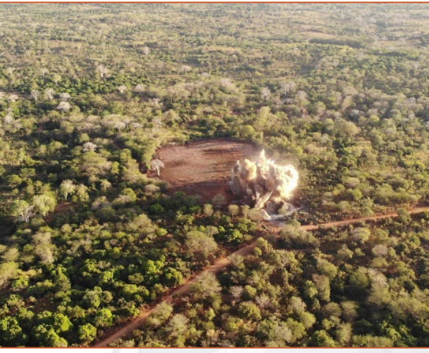
Figure 1: Blast sequence at the starter pit looking south. The main super high-grade zones are approximately 30m to 50m to the east (left) of the blast zone and strike NE-SW.

The starter pit area is in the hanging wall of the initial-term production area and although care was taken to avoid the core super-high-grade zones, there is still an instance of a known and modelled high-grade zone within the starter pit.