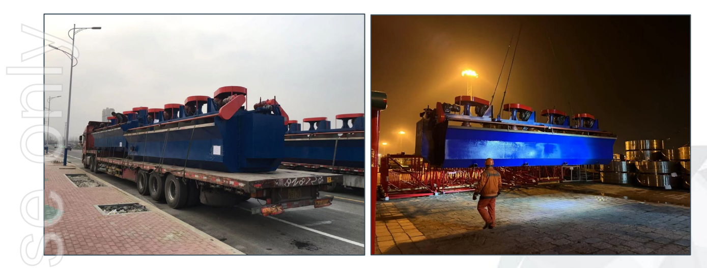
Figure 1: Floatation Cells being transported to and offloaded at the port of Shanghai.