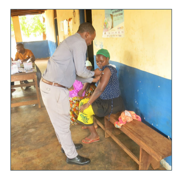
Figure 5: Recent vaccination program at the village of Matambarale

Lindi Jumbo has also committed to improve the local mine bypass road to an all-weather condition.