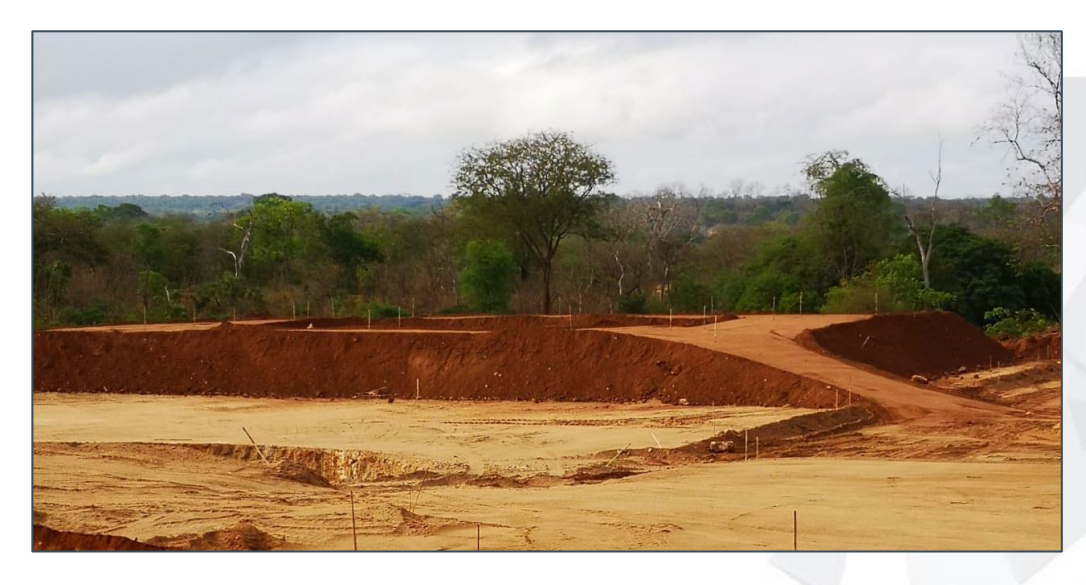
Figure 3: Raw Water Pond located within the prepared processing plant area.