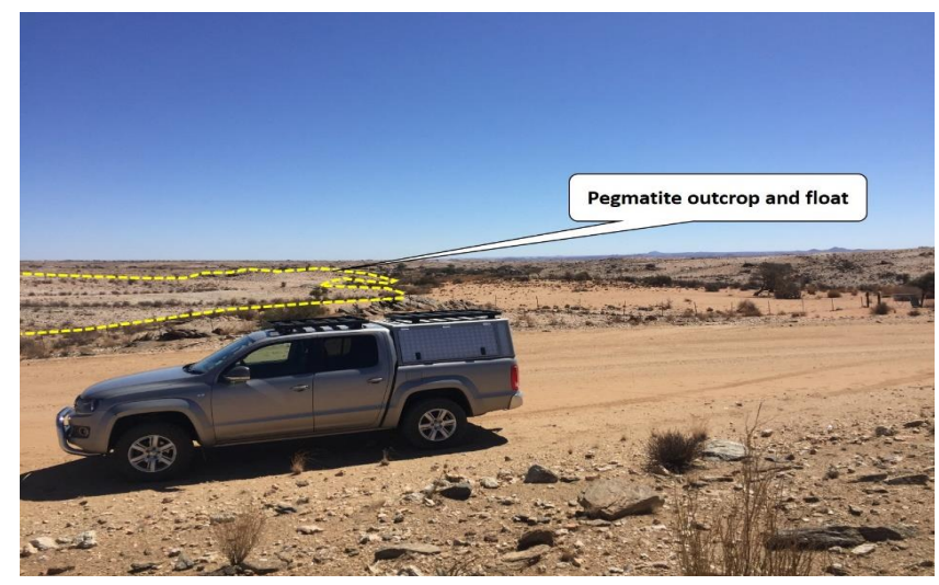
Figure 1: Pegmatite outcrop zones on EPL6308 in Namibia