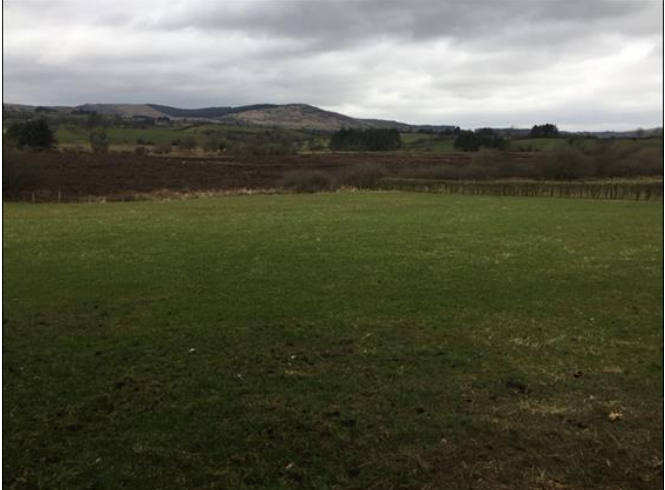
Figure 3: General topography of the Corvanaghan-Golden Hollow target area.

The results of the EM survey in conjunction with ongoing soil sampling results will delineate drill-ready targets.