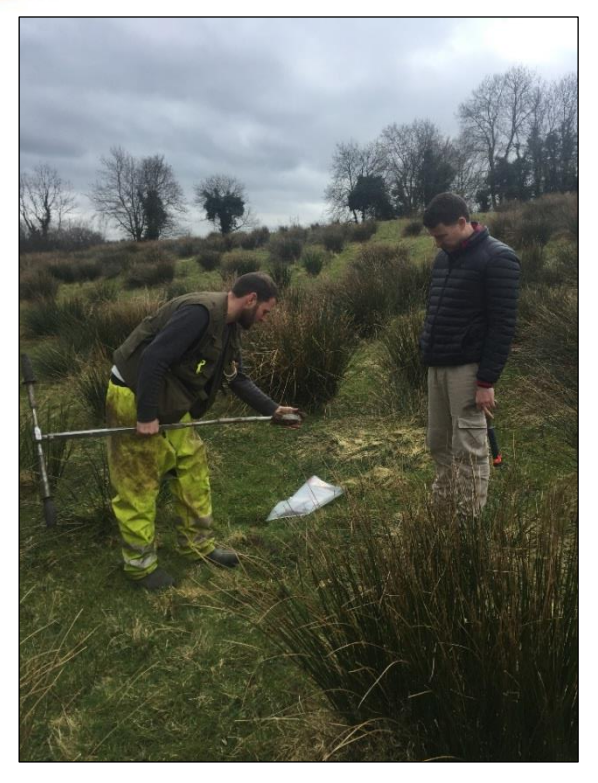
Figure 4: Company geologists soil sampling in the Corvanaghan-Golden Hollow target area.