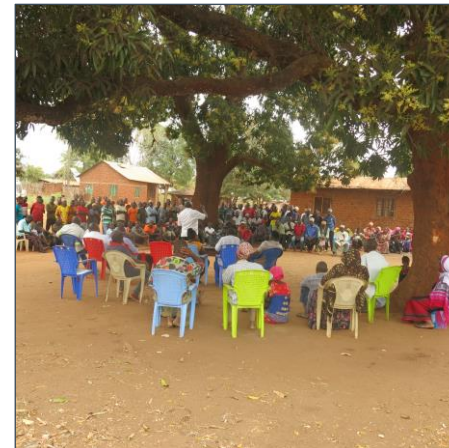
Village meeting July 2021